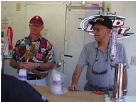
Look who is minding the Beer Garden....