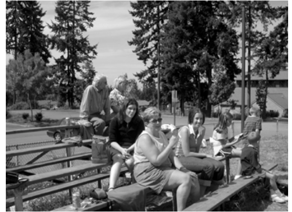
"and the crowd goes wild..."