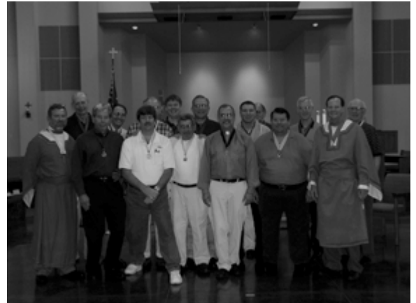
"The whole group"