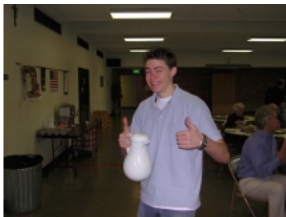
We're having fun now...