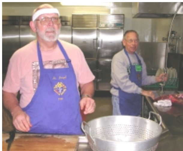
We know who does all the work around here...