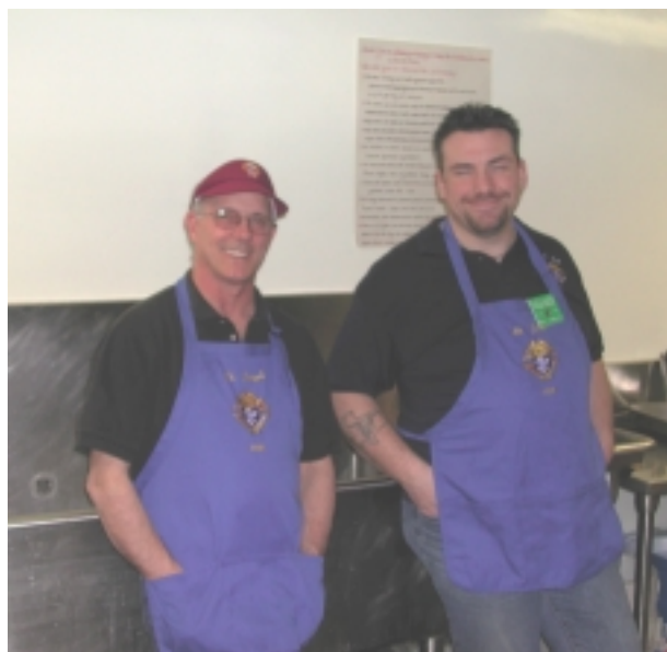
No telling what these guys are up to....