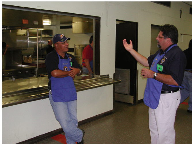
"What Sa Matta For You"