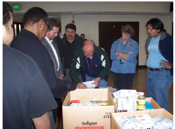
I have your turkey here somewhere...