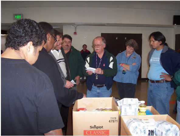
now, go down here and turn left.....or is it right