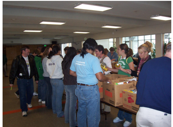
load-um up, move-um out...