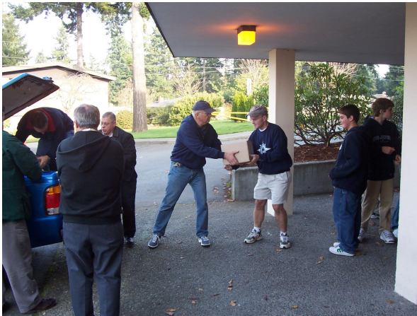
tote that bail...