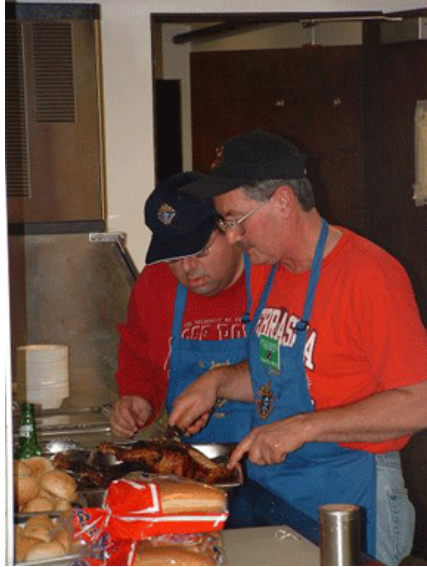
I know I dropped it here somewhere