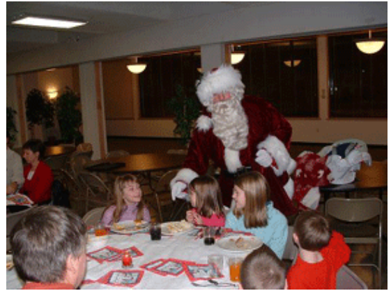
There's old Jelly Belly...