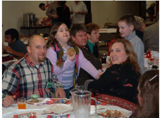
We're having fun now...