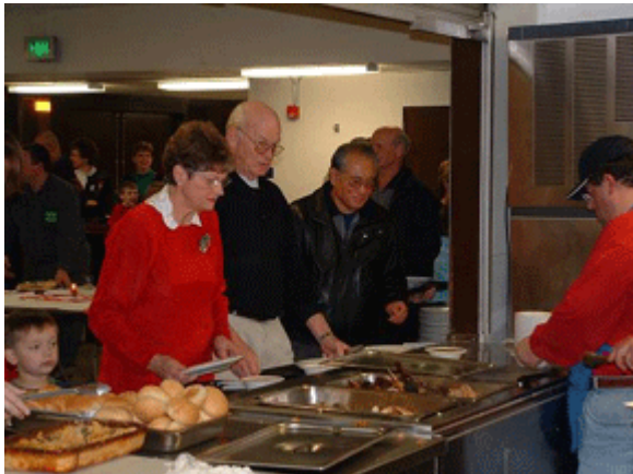
Where's the food....