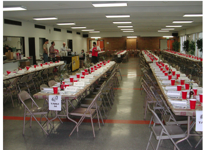
the hall setup was fantastic...

And here are some pictures from the event for your viewing pleasure: