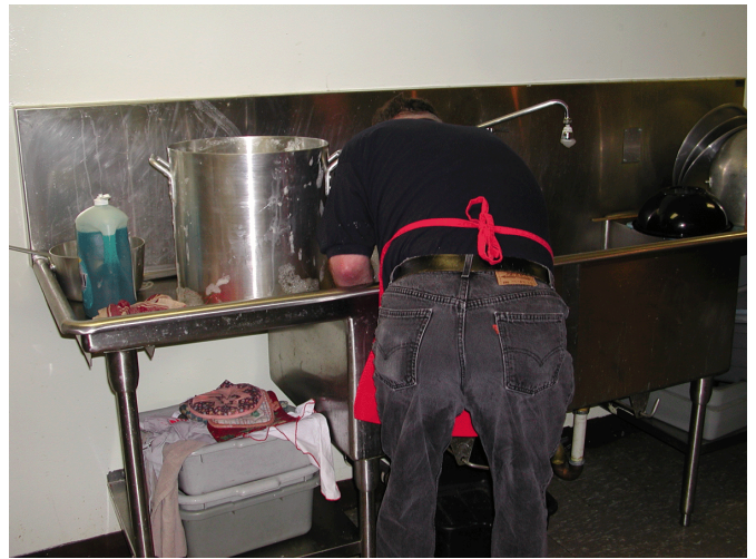
can you identify this Pearl Diver?