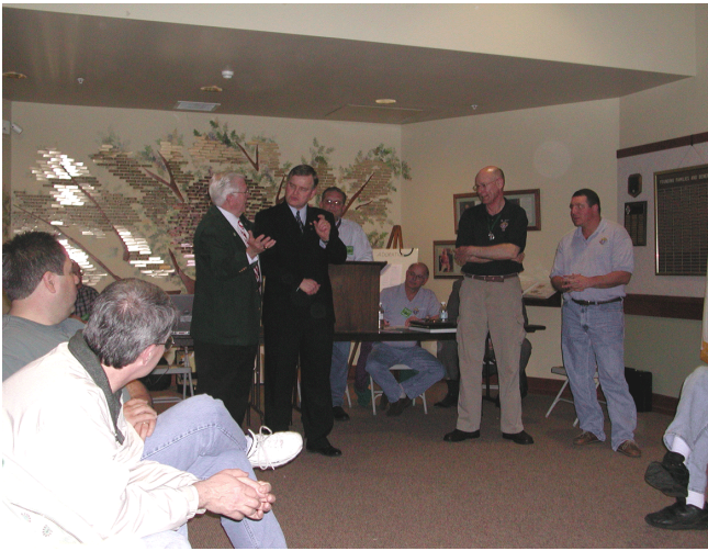
Does the Insurance Guy know the answers...