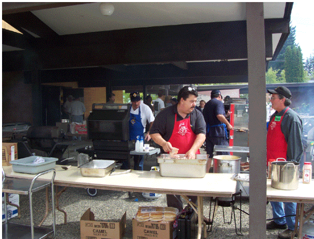
the Chicken Man...