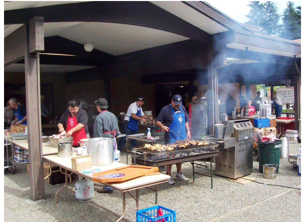
the Other Chicken Man...