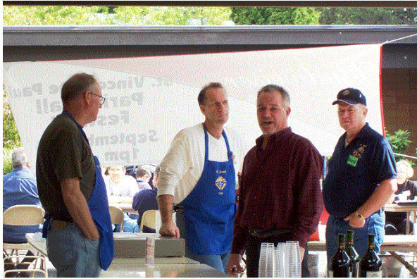
yes we manned the beer garden...