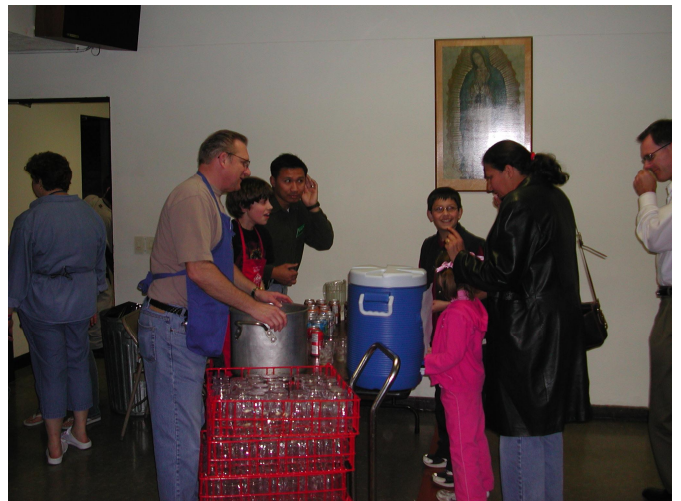
Ehh...what did you say...