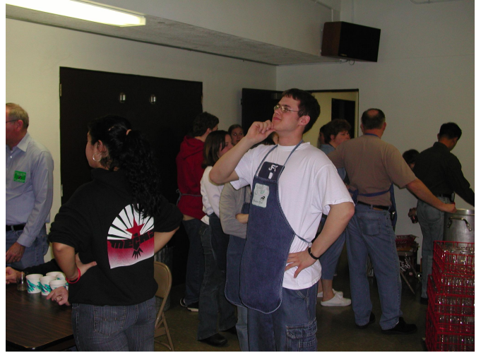
Mission Trekkers were invaluable this year...