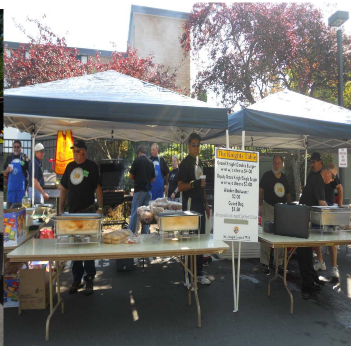
FALL FESTIVAL PICTURES