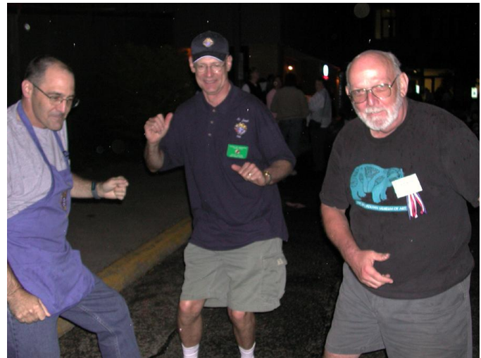
Twist and Shout...

(Note: No Knights of Columbus were injured as a result of this event.)