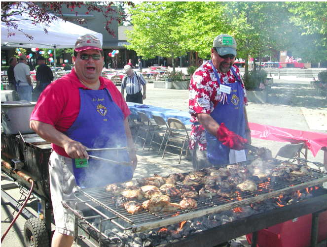
Now that's what I call cookin...